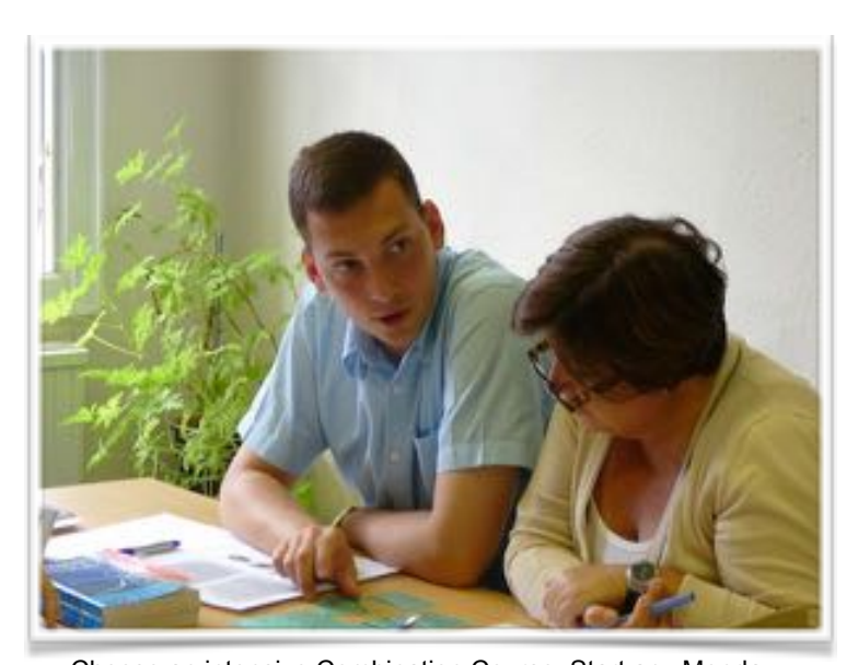
Choose an intensive Combination Course, Start any Monday