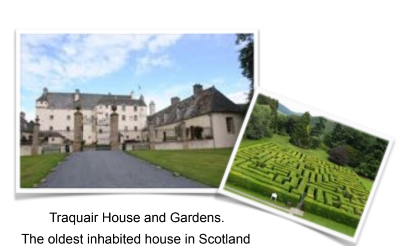
The William Wallace monument