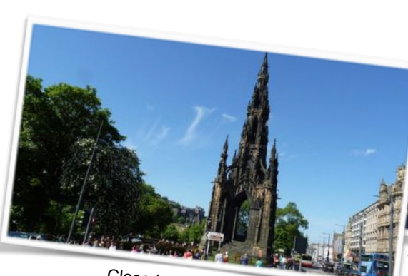
Close to many attractions

ECS Scotland is located in the centre of Edinburgh. The school is easily accessible from all parts of the city by bus and is within easy walking distance of many of the main attractions, parks, restaurants, cafes and shops.