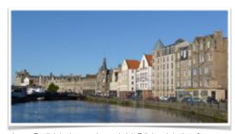
Learn English in the morning and visit Edinburgh in the afternoon

The afternoons are free for you to explore the city on your own or take part in optional activities arranged by ECS Scotland. Whisky tasting, a Scottish cookery course, a historical and scenic walk, visit the Royal Yacht Britannia, Edinburgh Castle or go shopping.