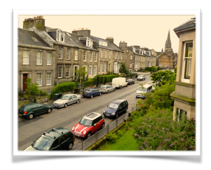
Example location of homestay accommodation