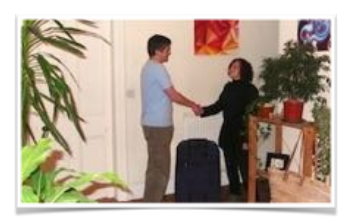
A friendly Scottish welcome

accommodation for students studying at the school. Staying with a native speaker host enables you to spend as much time as possible speaking English outside the classroom. Living with a local person also gives you an insight into British and Scottish culture.