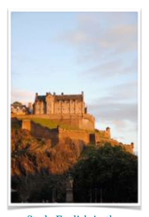
Study English in the centre of Edinburgh