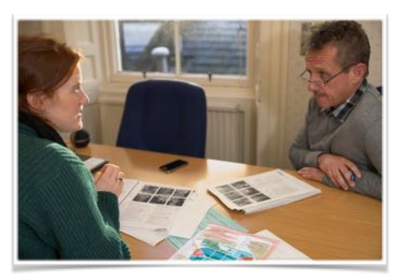
Specific English 1-to-1 classes in the afternoons

The aim of these courses is to develop overall English communication skills alongside more specific English language areas such as; business, medicine, law, environmental science, politics, aviation, tourism, journalism, sales, marketing, politics. Other specific needs or topic areas can be covered on request.