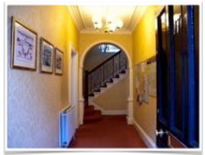
Welcome to ECS Scotland

ECS Scotland is a family-run, British Council accredited English language school founded in Edinburgh in 1995.