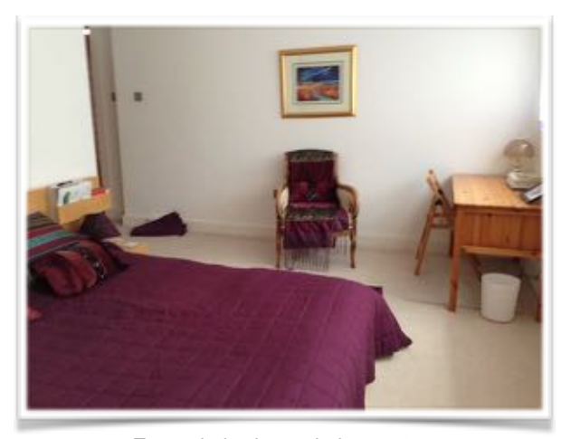
Example bedroom in homestay

Homestay accommodation is provided in comfortable and conveniently located homes all over Edinburgh.