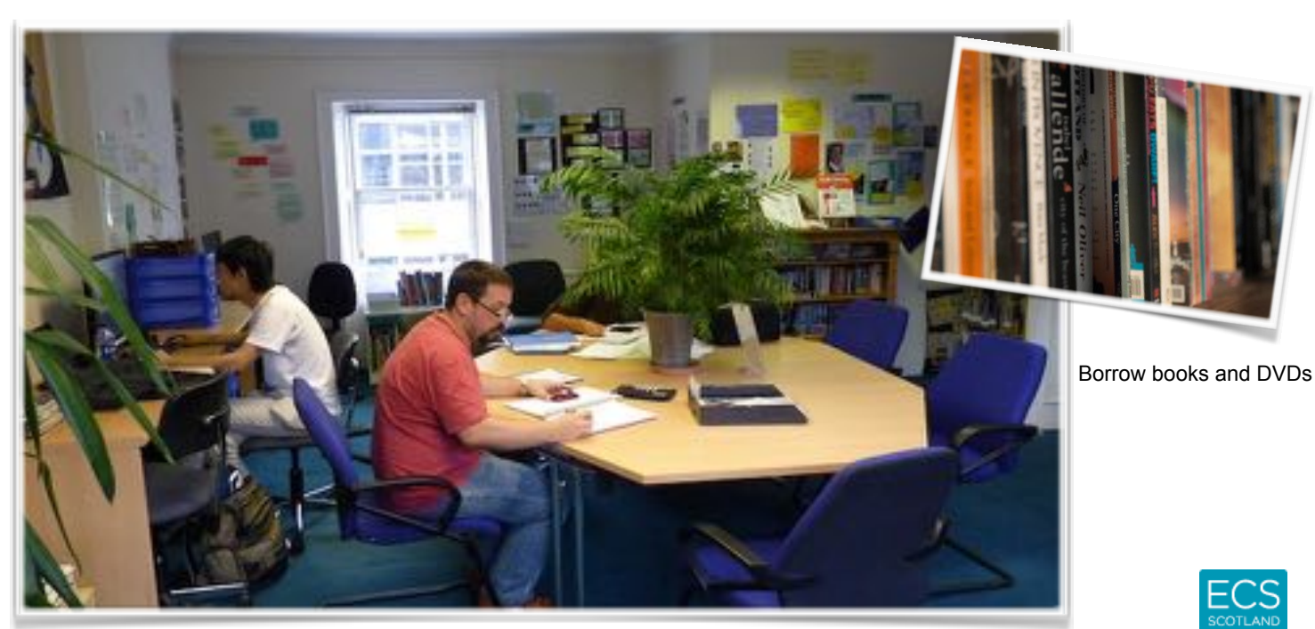
Self-study area. Take advantage of extra listening, reading and grammar material.

We encourage all students to use the resources available to consolidate what is learnt in the classroom.