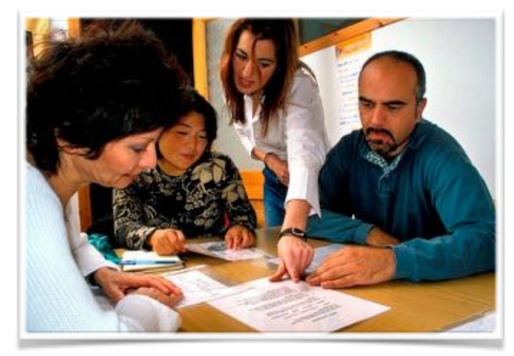
English for business and work