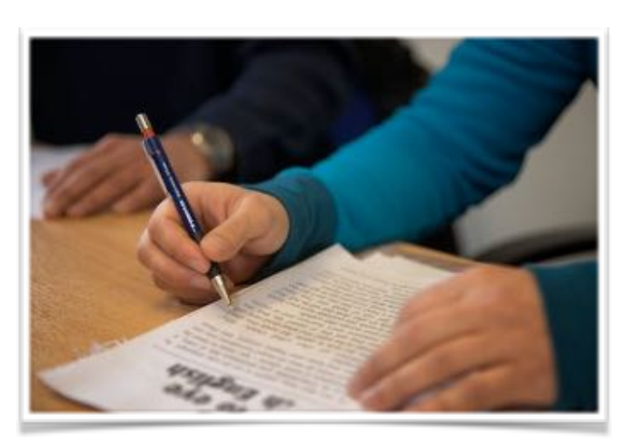
Improve your Academic English before starting university

Intensive Academic English courses are available throughout the year as a Combination Course for students who require assistance with proof-reading their written work, or help preparing a presentation or project in English.