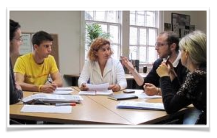
Maximum 5 students per group