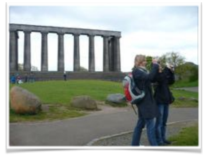
Practise your English while visiting Edinburgh with your teacher

Individual Tuition courses are available for all levels from