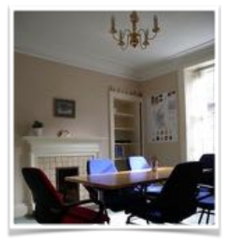
Georgian house with classic features

Teaching takes place in an attractive Georgian house, which maintains many of the classic features of a building from that era. The building has been refurbished to provide a comfortable and calm learning environment.