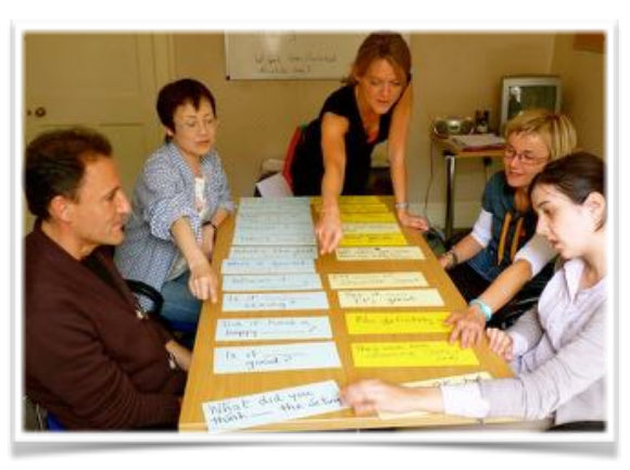
Use English for traveling, socialising and working

General English group courses are available for all levels from beginner to advanced